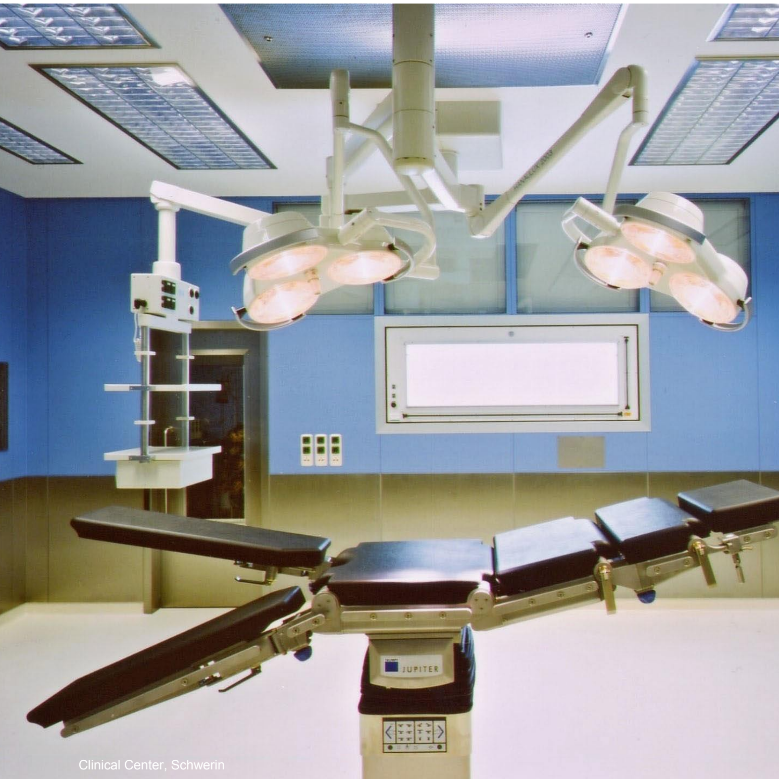
Clinical Center, Schwerin