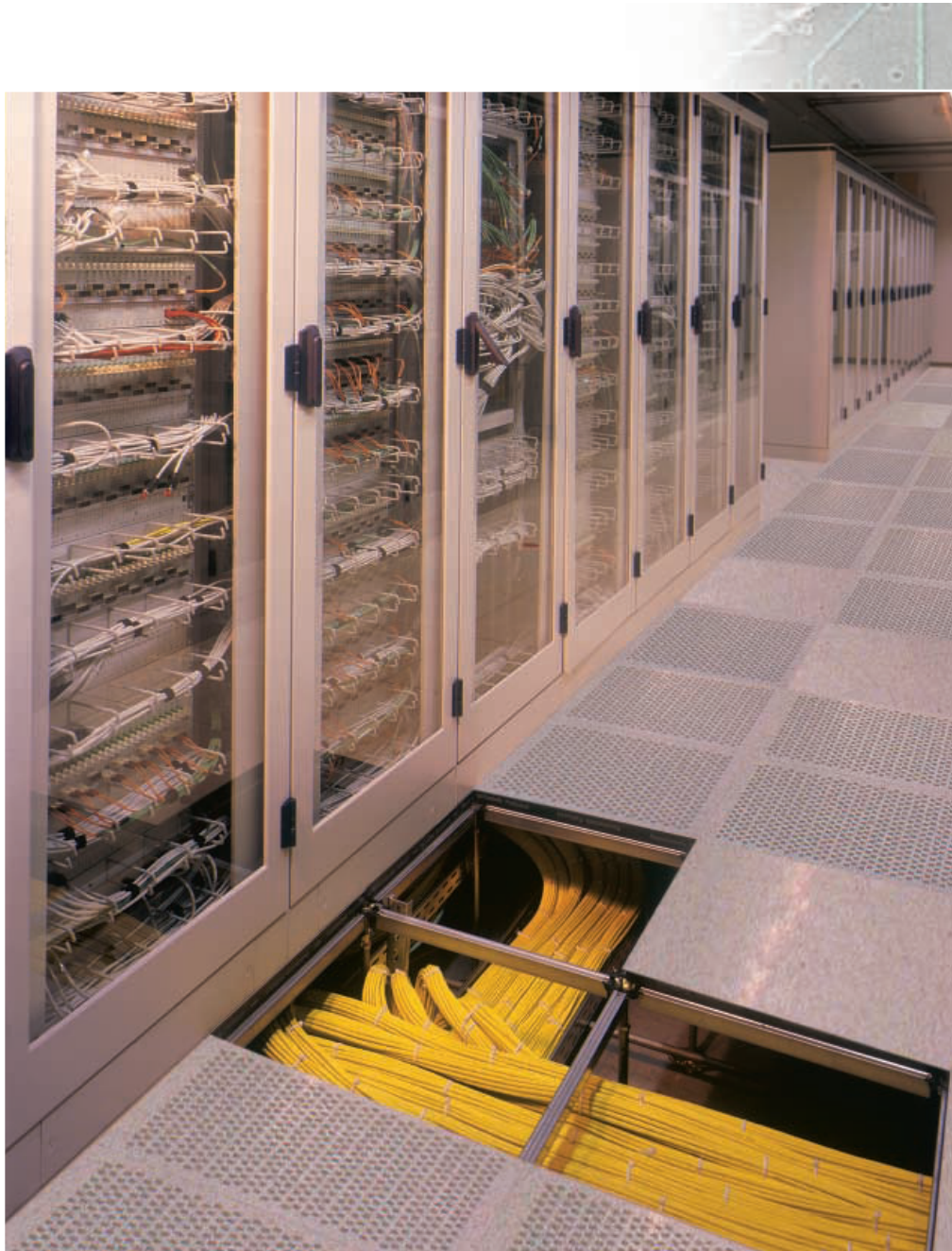
TechDataCenter, Munich (Germany)