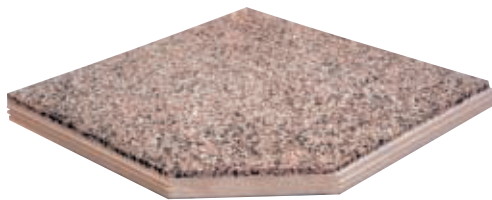
FLOOR and more STONEline *