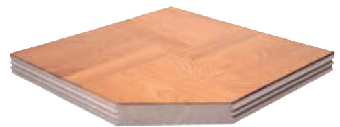
FLOOR and more WOODline *